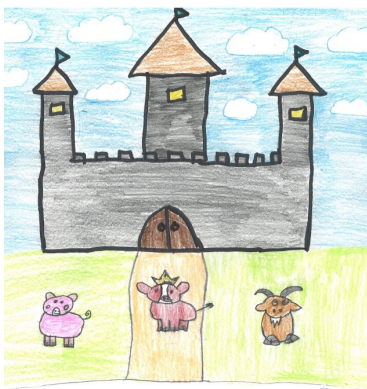
Southwestern New Mexico State Fair

FAIREST OF THEM ALL 76th Anniversary October 5-9, 2012